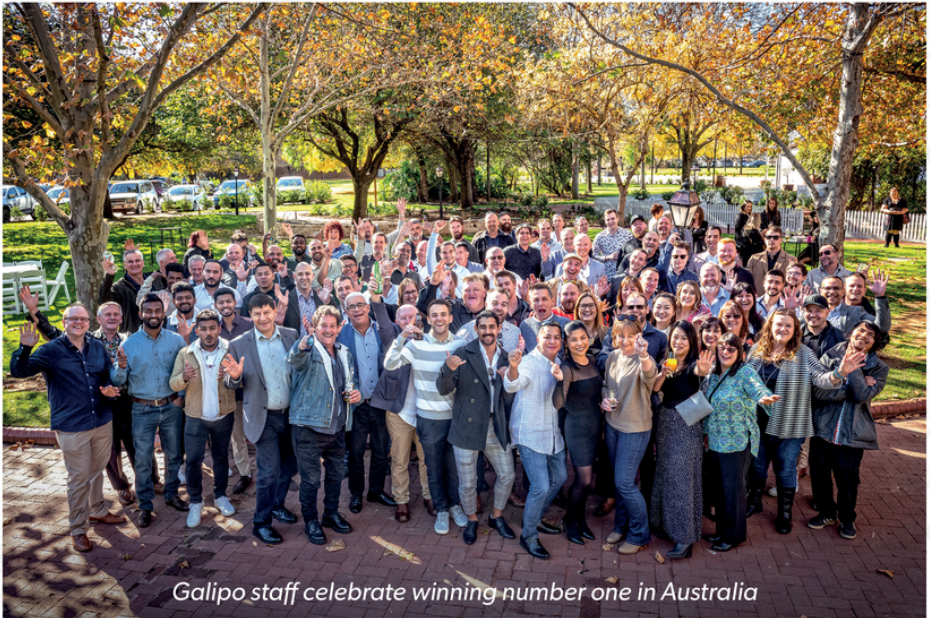
Galipo staff celebrate winning number one in Australia

Proudly South Australian, family owned foodservice distributor providing businesses with excellent service & delivery of approximately 8,000 food products.