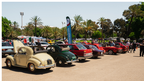
Autoclassica 2021, Photo: Futuro Avenue

Where: South Australian Italian Association, Carrington Street, Adelaide Cost: $185